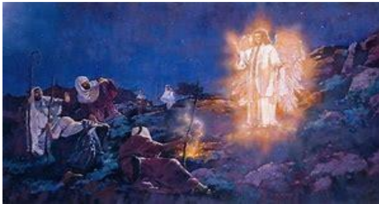
THE SHEPHERDS HEAR THE MESSAGE OF THE ANGELS Luke 2: 8-15

The first Noel the angel did say was to certain poor shepherds in fields as they lay; in fields where they lay keeping their sheep, on a cold winters night that was so deep. Noel, Noel, Noel, Noel, born is the King of Israel.